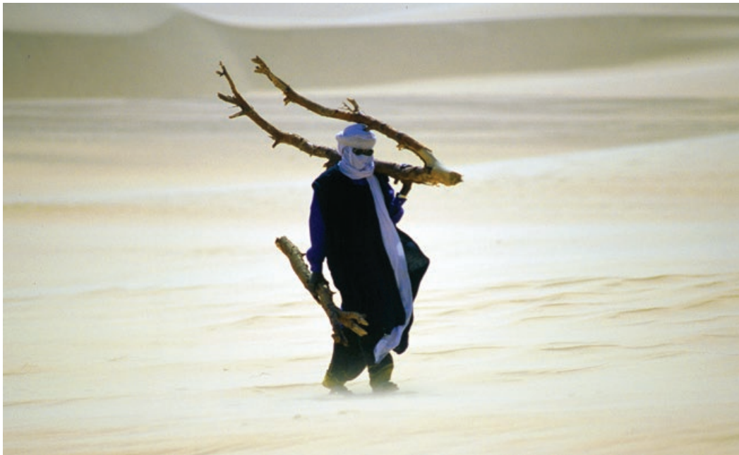
Figure 2: The extraordinary ability of humans to adapt to extreme environments. Touareg in Ténéré Desert, Niger.