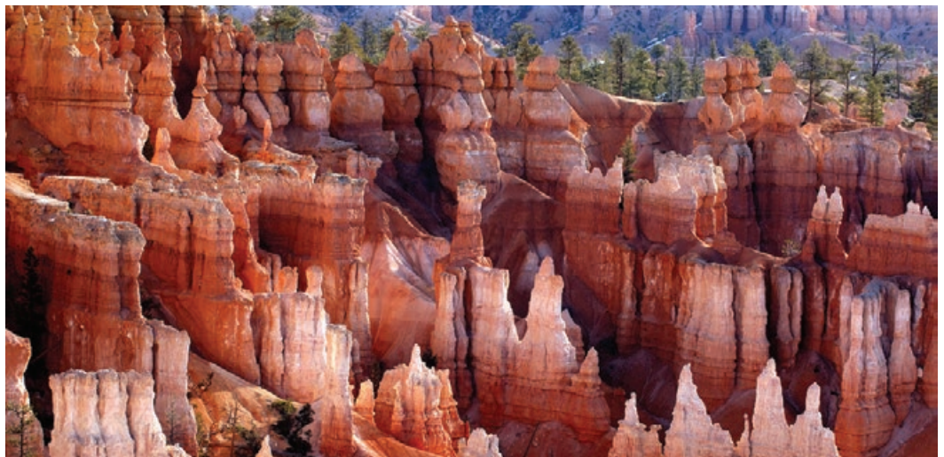
Figure 1: The unearthly landscape of hoodoos in Bryce Canyon National Park, Utah.

As the GA’s Manifesto for geography (GA, 2009) makes clear, part of the power of geography is to both ‘satisfy and nourish’ the connection with and curiosity about the world experienced by every human being. This creates a strong argument, I think, for the curriculum to take young people beyond themselves and their everyday experiences by studying the extraordinary physical variety of Earth’s surface. There is (or can be) a visceral feel to this geography: exploration of the sheer scale, diversity and majesty of Earth’s landscapes and natural environments; encounters with the extremities of climate, natural history and topography. ‘Awe and wonder’ are not the only responses to anticipate here: the scale of the world, the idea of deep time or the indiscriminate violence of some natural phenomena can make humans feel vulnerable and inconsequential. At the same time, they stir curiosity in young minds, which may begin to wonder, for example, how an unearthly landscape was formed (Figure 1). This reminds us that geography at every level has the potential for both explanatory and descriptive power, meaning that students in this key stage need to be taught the processes which create landscapes in order to better understand the world in which they live.