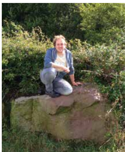
Figure 3: Owd Ma's Bowder.

bowder', a sizeable granite boulder in a hedgerow at the foot of Beeston Crag (Figure 3). The boulder is particularly interesting in a folkloric sense because it alludes to a woman who must have been a giant to carry the sizable boulder from the top of the crag (as she allegedly did). In fact folktales of giants in England are rarer than those concerning the devil; the oral traditions of Wales, Ireland and Scotland being more readily maintained, and tales of giants tend to pervade in more mountainous regions (Westwood and Simpson, 2005). Consequently, although